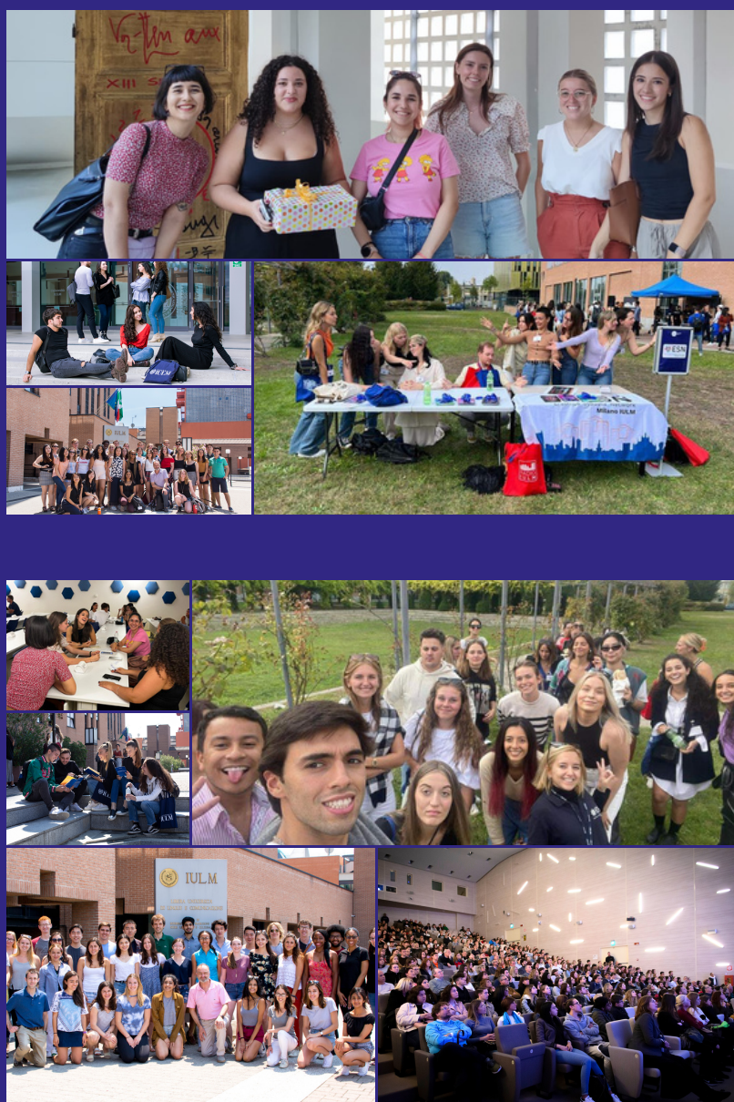
Some of our Welcome Days

Look at this video to see some of their experiences.